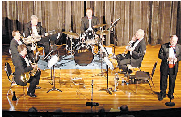
The Impact of Brass - Stoughton Opera House